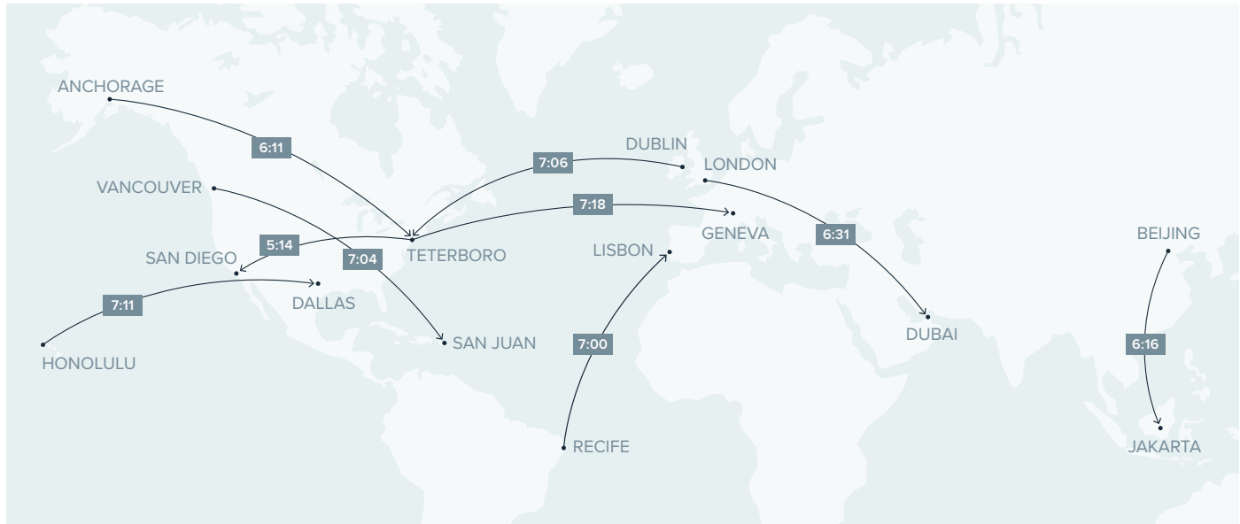
Range based on 4-passenger mission at HSC, 85% annual winds, ISA with NBAA IFR reserves (200 nm alternate).