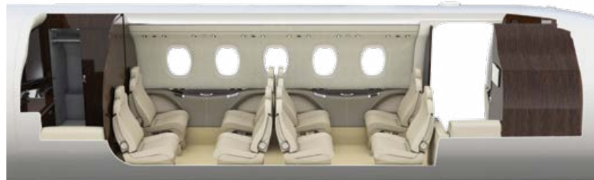
GALLEY WITH SIDE-FACING SEAT